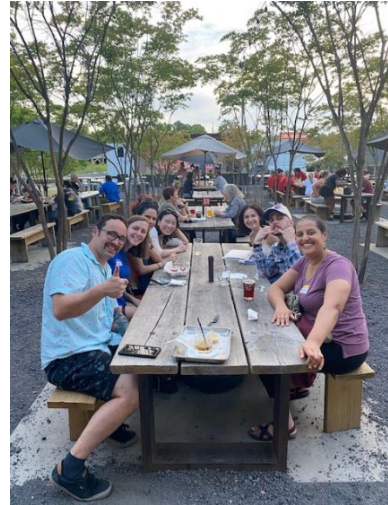
All Smiles In HPEB