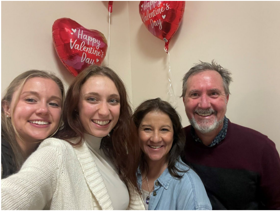
HPEB Family Time!